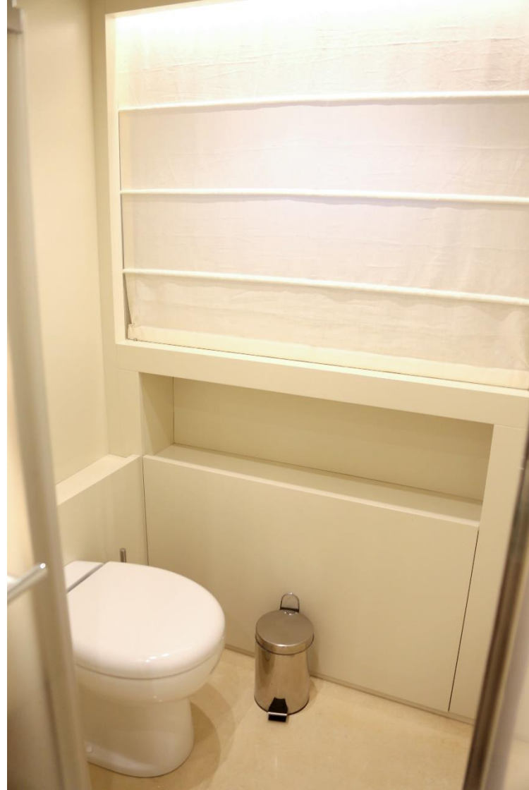
VIP cabin bathroom