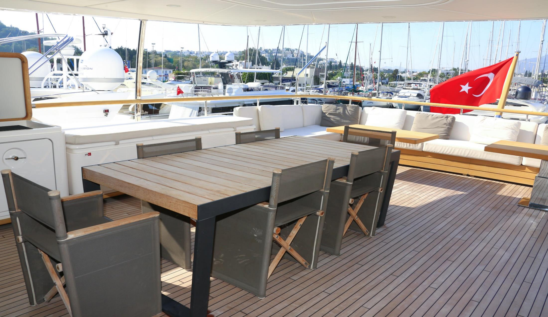
Upper deck cockpit