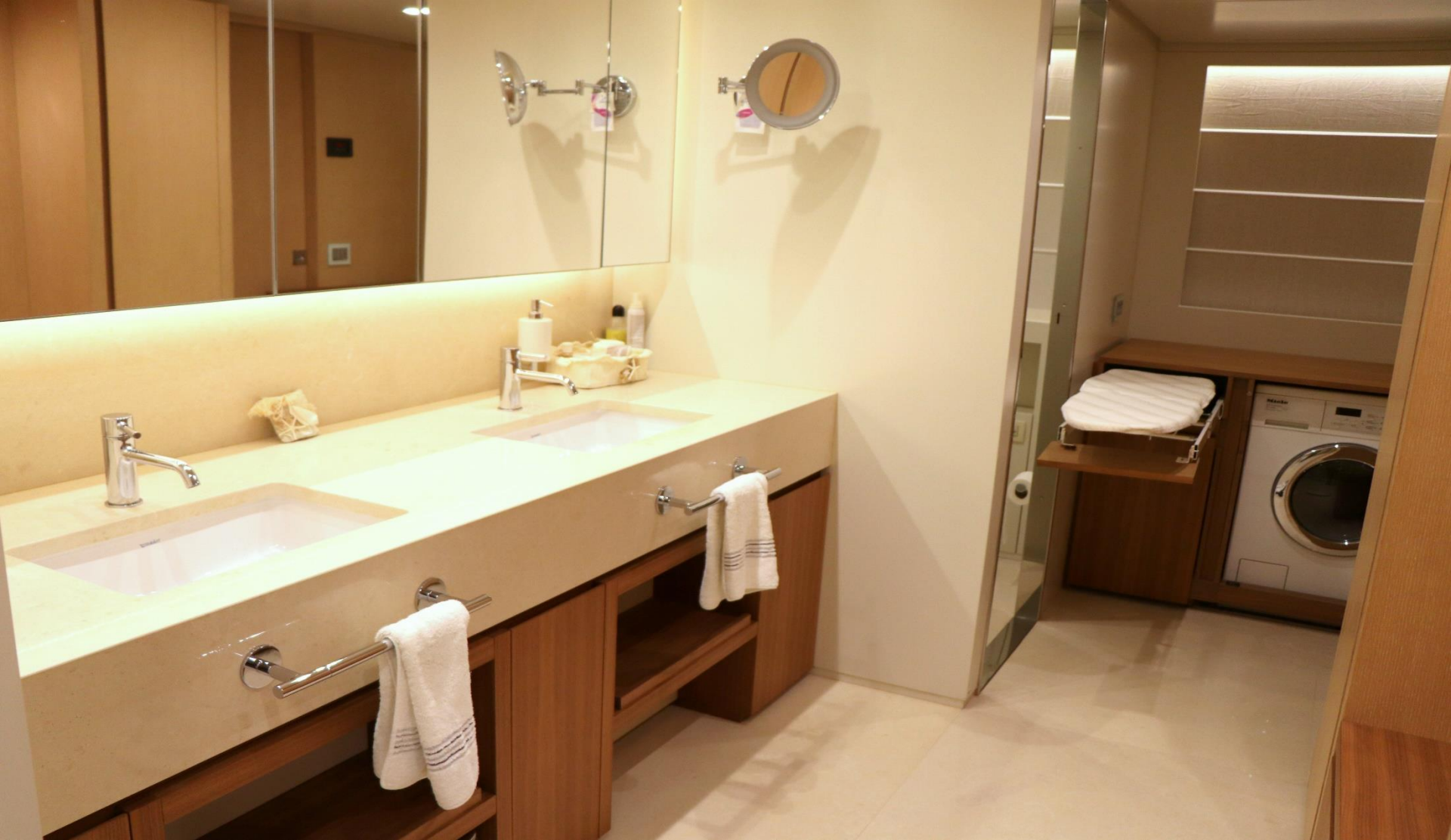
Owner's cabin bathroom