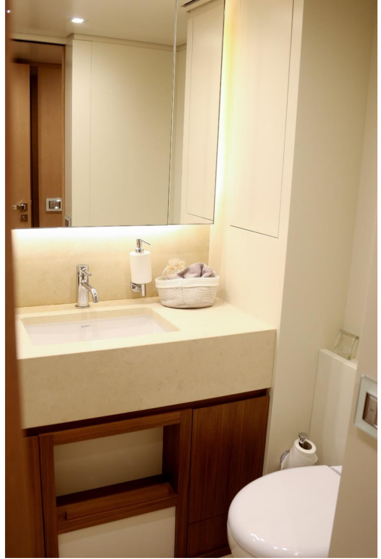
Guest cabin bathroom