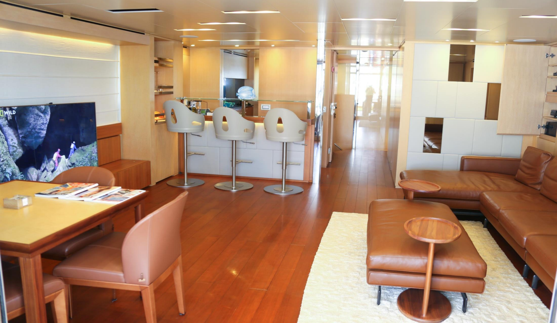
Upper deck salon